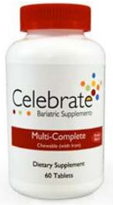
Celebrate Multi Complete

1. Select any of the multivitamins below and take one tablet three times a day