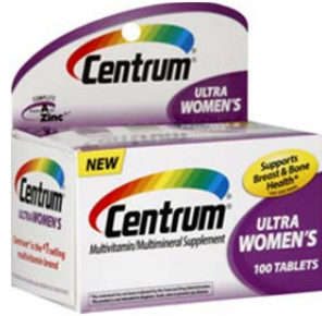
Centrum Ultra Women's Tablets