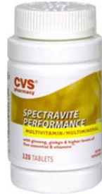
CVS Spectravite Performance Up Tablets