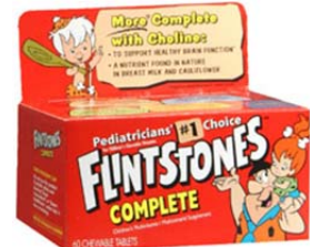
Flintstones Chewable Tablets Complete

2. Take Calcium + D supplements 3 times a day from any of the products below: