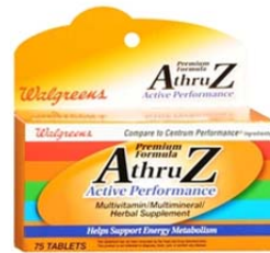
Walgreens Premium Formula A Thru Z Active Performance